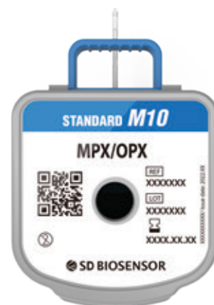
STANDARD™ M10 MPX/OPX